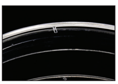
Ventilation ribs allow for free air circulation and reduce condensation during incubation