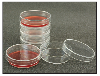
Smaller diameter uses less media -"Media Saver"